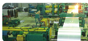
恶劣环境 Harsh environment