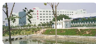
环境友好 Environmentally friendly