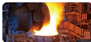
高温 High temperature