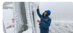
低温 Low temperature