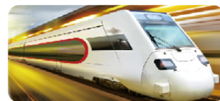
高速 High speed