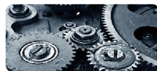
长寿命 Long service life